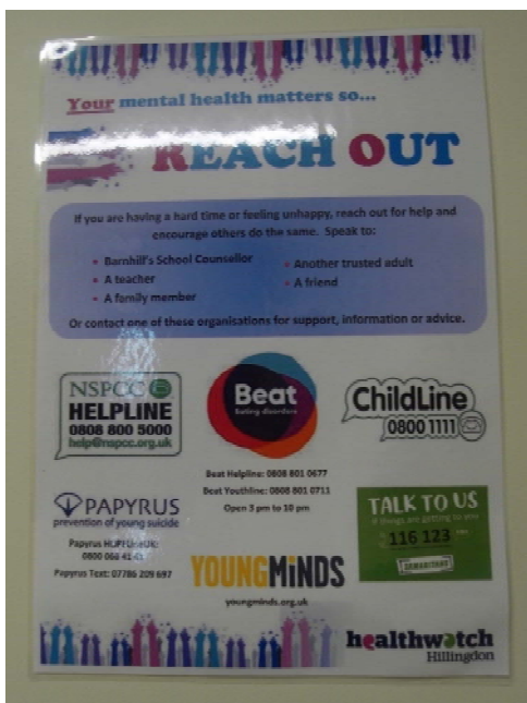
The poster created by students as part of their campaign.