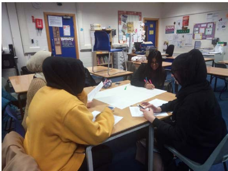
Publicity and Presentation Group working on how to publicise the whole school survey.