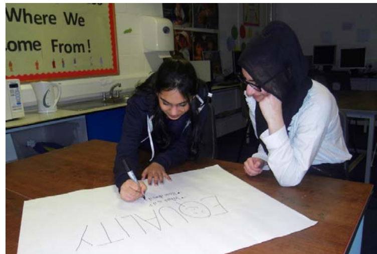
Preparing to present during the Public Speaking and Presentation Skills session