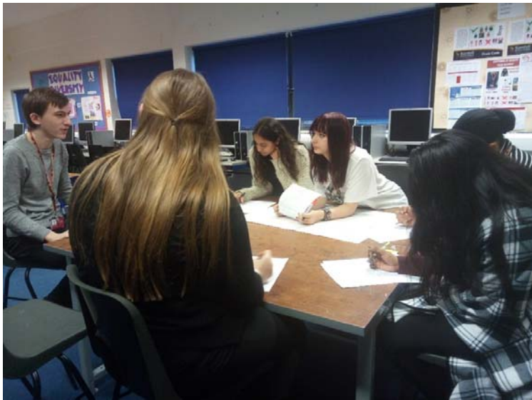
Research and Data Group work on developing the whole school survey.